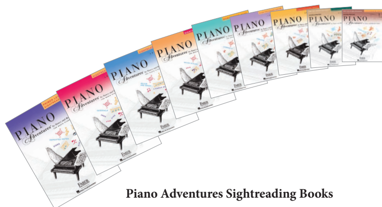
Piano Adventures Sightreading Books